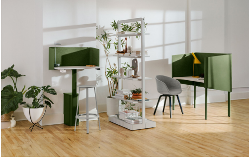
View image library