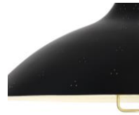
// Soft Black