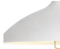
// Classic White