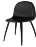
// Blackstained beech