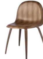
// American Walnut