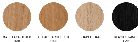
MATT LACQUERED OAK