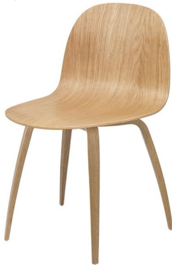
//Oak / Wood base